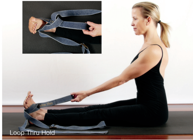
Loop Thru Hold