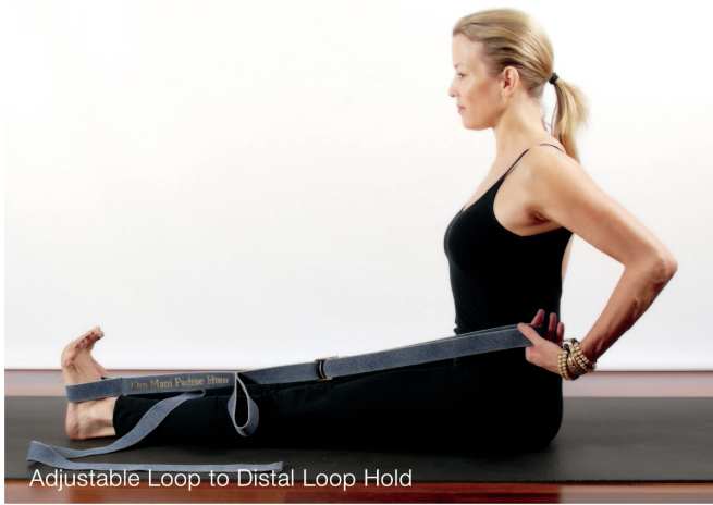
Adjustable Loop to Distal Loop Hold