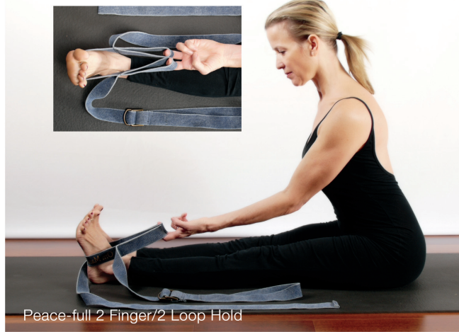
Peace-full 2 Finger/2 Loop Hold