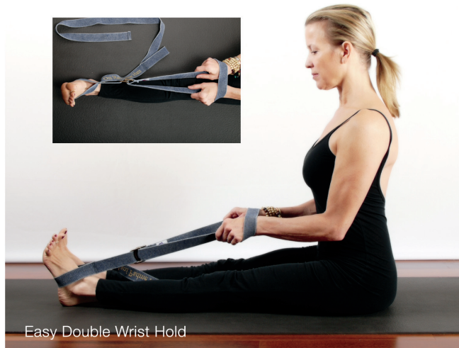
Easy Double Wrist Hold